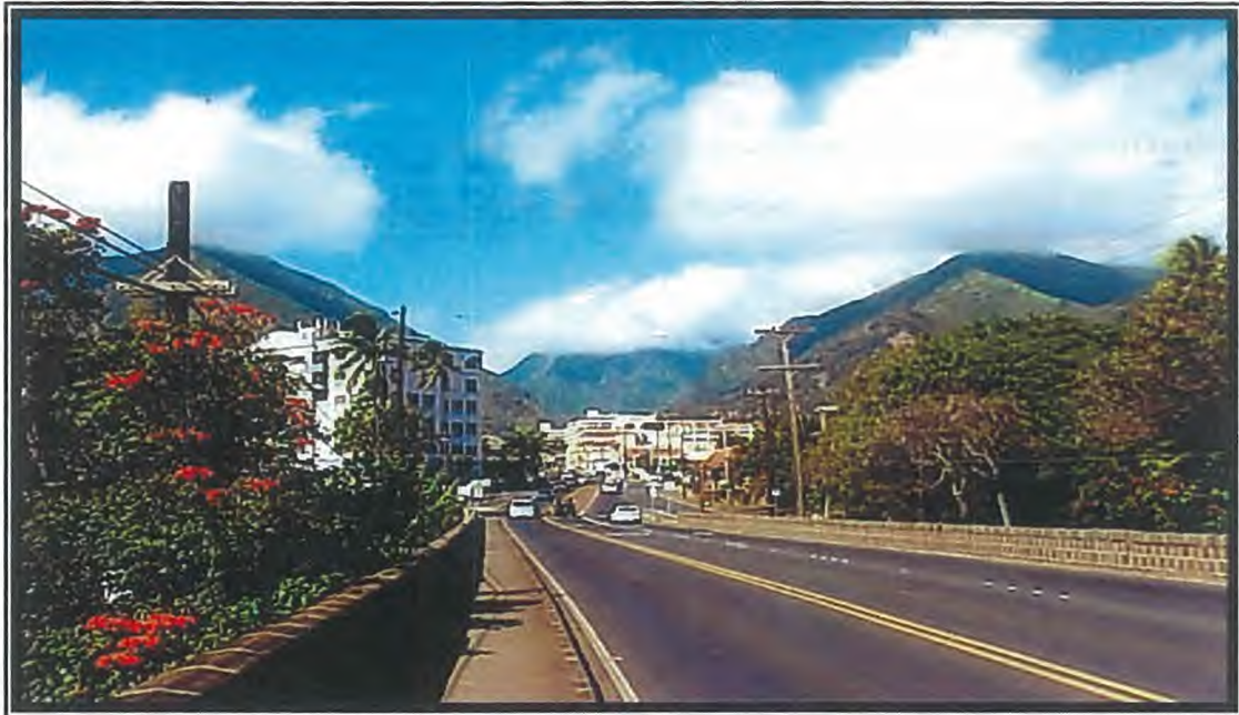
Main Street in Wailuku-Road improvement projects could be funded through the CIP process.

The development of the CIP program falls within the framework of the Countywide Policy Plan, Maui Island Plan, Maui's six (6) Community Plans, and the Molokai and Lāna'i Community Plans. Population forecasts for a 20-year timeframe and urban and rural growth areas identified in the Maui Island Plan will provide the basis for infrastructure planning for Maui Island.