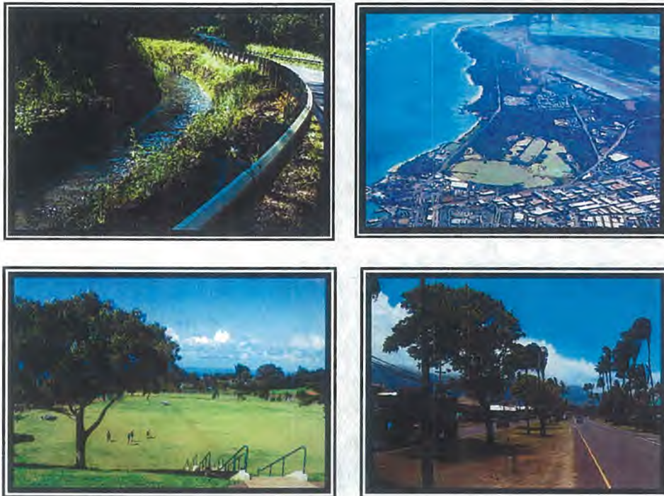
Examples of infrastructure/public facilities including water (irrigation ditch), airports (Kahului Airport), parks (Eddie Tam), and roads (Hāna Highway).

This chapter establishes a broadly defined infrastructure strategy and policy framework to strengthen infrastructure planning and delivery on Maui, and to identify short, medium, and long-term capital projects and costs to address existing service deficits and projected growth to 2030.