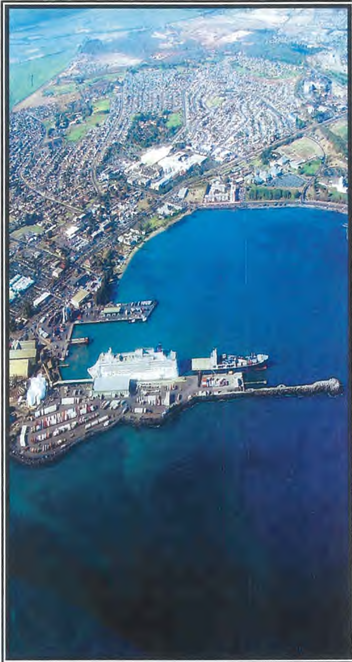
Aerial view of Kahului Harbor. Maui, Hawai'i.

T he Long Range Implementation Program establishes a general framework for the implementation of the Maui Island Plan. As part of planning for Maui's future, a financial program is needed that