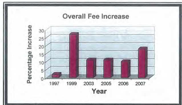
Figure 10 - 2. Overall Sewer Fee Increases.